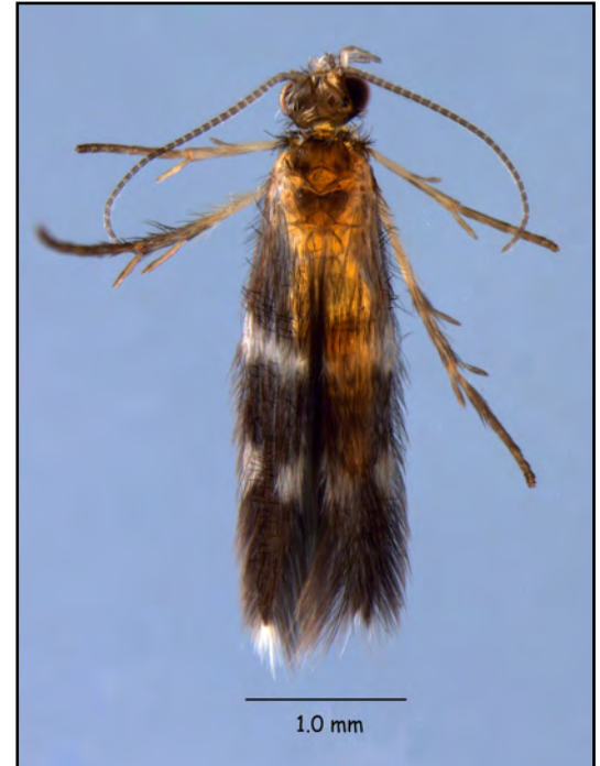
Adult Ochrotrichia species