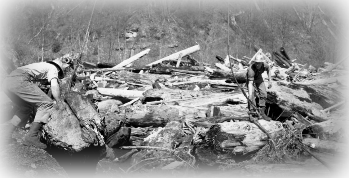
Stream cleaning by the BLM in 1957

As trees begin to flower, it's obvious that change is in the air. Before we dive into a summer of restoration, it's a good time to look back at where we've come from.