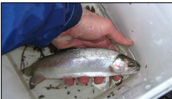
Steelhead Smolt

Smoltification is a taxing process, but living in the ocean has advantages – and disadvantages, like predators. Big, scary ones too. Being a smolt is like being a freshman the first day of high school – easy prey. But, unlike high school, the ocean is full of really nutritious food. And not unlike a teenaged freshman, smolts are ravenous. They need to be. The